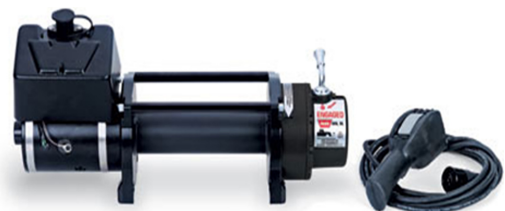
Fig. 5 Net winch

A net winch is used solely for lifting the net from under the sea when the net has been filled with a sufficient amount of fish. Two winches, as shown in Fig. 5, are employed for the lifting operation, one on each side of the inner hull of the catamaran. Ropes are tied to the upper edges of the net and rolled on the winch drum (Regnu Rama Das 2017). The winch itself is run through an electric motor powered by a set of batteries. The power required to run the net winch is from the maximum load of the winch multiplied by its work time.