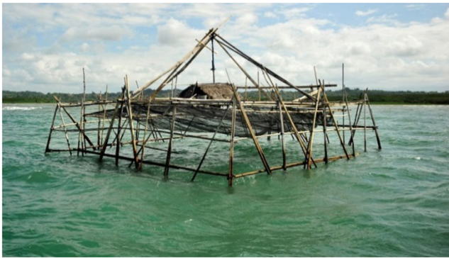
Fig. 1 Traditional bamboo fishing platform

on the platform. When the platforms are no longer useful due to age and decay, they are simply abandoned in their locations, eventually generating debris that is difficult to detect by passing ships. The fuel used for the electric generator sometimes drips into the sea and pollutes the surrounding area. Owing to these considerations, this study proposes an asymmetrical catamaran as an alternative to the bamboo structure; this catamaran is equipped with solar panels for a more environmentally friendly source of energy to be used on the fishing platform. Figure 1 shows a picture of the traditional bamboo fishing platform (Michelino 2010).