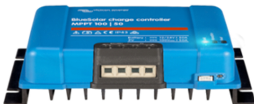
Fig. 4 Solar charge controller