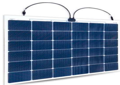
Fig. 3 PV panel

Solar energy is used to obtain clean and sustainable energy for the propulsion of the catamaran platform, operation of net